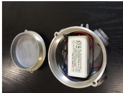
Led driver in ex-proof box, 220V AC

Above ranges have been obtained by 0,01 lux D/N box camera and zoom lens at absolute darkness